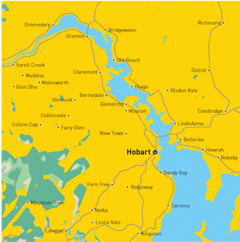
As at November 2008

■ 3G Voice, Data and Video On Street Coverage* ■ On Street Voice, GPRS and SMS Coverage* ■ Car Kit with External Antenna Voice, GPRS and SMS Coverage*