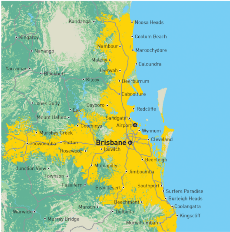
As at November 2008